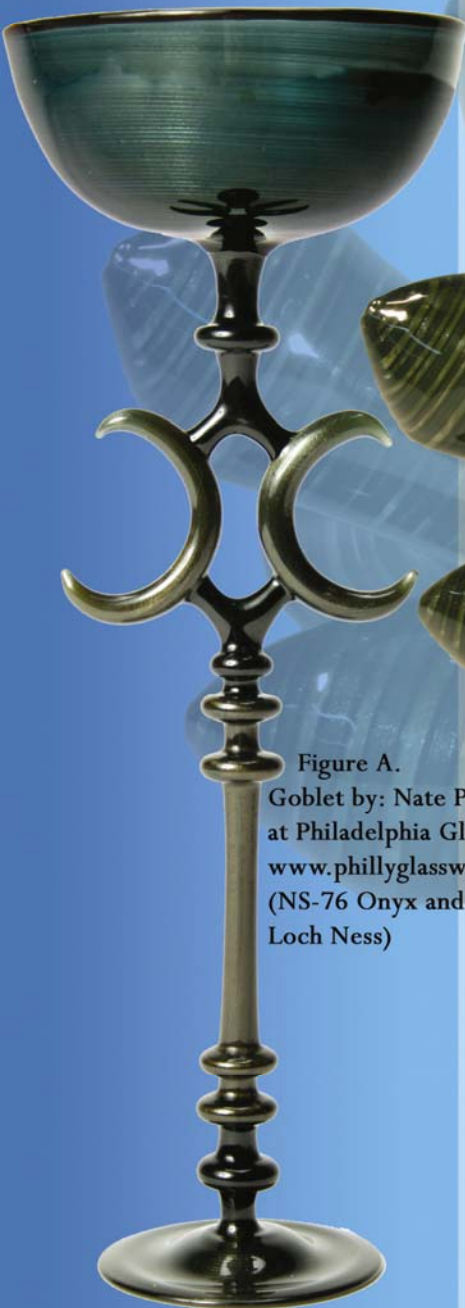
Figure A. Goblet by: Nate Purcell at Philadelphia Glass Works www.phillyglassworks.com (NS-76 Onyx and NS-98 Loch Ness)

Just in time for your summer projects, Northstar is excited to introduce the newest addition to our already extensive color palette. Let's all welcome NS-98 Loch Ness. A dark, fairly opaque, sparkly green, Loch Ness can be used in virtually every application. It should be worked in an oxidizing flame to achieve optimum results. Extended annealing time tends to turn this color to a darker green with a golden hue. This change is well represented in the figures below. The goblet top in figure A was annealed only once, as opposed to figures B and C which had extended annealing times.