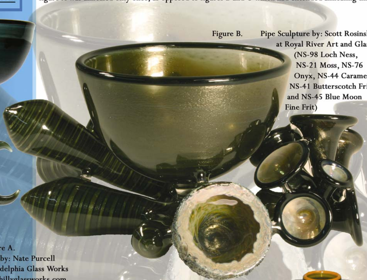
Figure B. Pipe Sculpture by: Scott Rosinski at Royal River Art and Glass (NS-98 Loch Ness, NS-21 Moss, NS-76 Onyx, NS-44 Caramel, NS-41 Butterscotch Frit and NS-45 Blue Moon Fine Frit)

Blowout Vessel By: Brian McCauley "Process: I gathered up the NS-98 Loch Ness rod to approx. 12 mm, then coated it with clear and backed it with NS-54 Star White. Next, I blew it out to a hollow tube, and honeycombed it. The NS-98 Loch Ness section was then attached to two hollow sections of NS-04 Dark Multi encased in clear. I finalized the piece with a NS-84 Goldenrod lip wrap to accent the yellow highlights. Thank You NorthStar!" ~Brian McCauley~