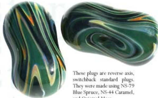
FIGURE 7 Plugs by: Alex Peters 1" height, 1/2" width (Standard Plugs)

These plugs are reverse axis, switchback standard plugs. They were made using NS-79 Blue Spruce, NS-44 Caramel, and Original Moss.