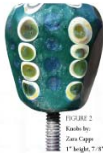
FIGURE 2 Knobs by: Zara Capps 1" height, 7/8" width

Knob 1-NS-52 Teal NS-44 Caramel (dots) NS-38 Intense Blue Green (dots)