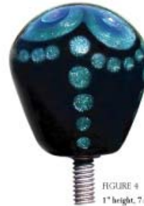
FIGURE 4 1" height, 7/8" width

Knob 2-NS-90 Rhapsody NS-74 Transparent Millennium Moss (dots)/discontinued NS-54 Star White (dots) NS-79 Blue Spruce (dots)