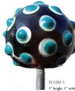
FIGURE 3 1" height, 1" width

Knob 1-NS-52 Teal NS-44 Caramel (dots) NS-38 Intense Blue Green (dots)