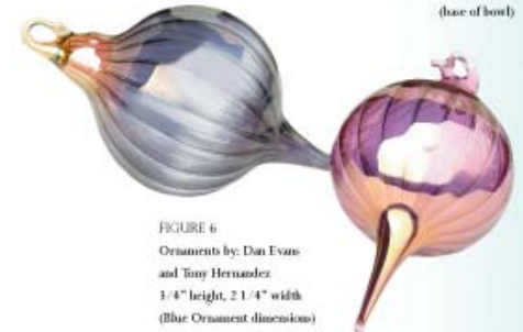
FIGURE 6 Ornaments by: Dan Evans and Tony Hernandez 1 1/4" height, 2 1/4" width (Blue Ornament dimensions)

The bowl was made using NS-78 Mystery Aventurine, NS-81 Blue Caramel Powder, NS-90 Rhapsody and was fumed with silver. The ornaments were all made using gold fuming.