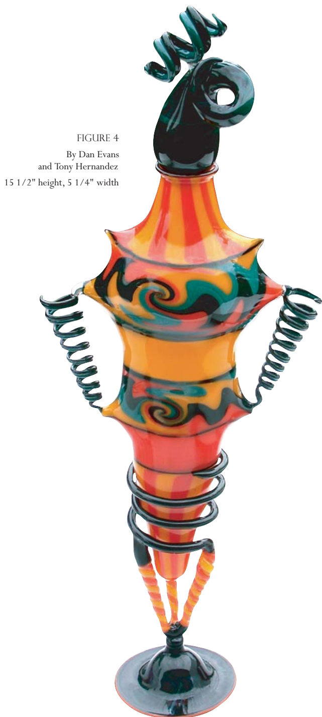
FIGURE 4 By Dan Evans and Tony Hernandez 15 1/2" height, 5 1/4" width