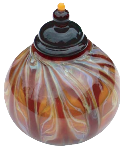
FIGURE 5 By Jesse Kohl 2 3/4" height, 2" width

This is accomplished during the initial strike and will result in a slightly more intense shade of red than that of the raw rod. There is great potential in these colors and it is an exciting development to explore!