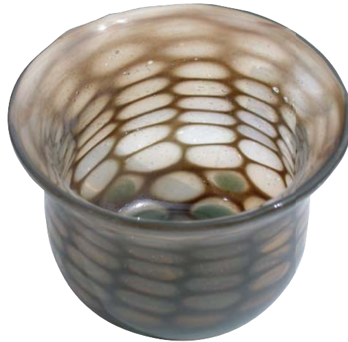
FIGURE 7 By Brian Holsonback 1 3/4" height, 2 1/2" width