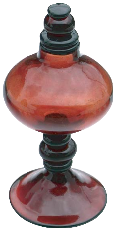
FIGURE 2 By Bryan C. Wise from Tecnolux 6" height, 2 3/4" width

"The Garnet is soft and smooth to work, making the encasing especially easy to perform. Although the Onyx is noticeably more viscous than Garnet at working temperature, this provided a nice tension to the lip and foot rim which helped in flaring them open-on-center. In joining the body, stem, and foot, the "mechanical" devitrification that typically occurs with pairing two contrasting viscosities was quite minimal and easy to polish off.