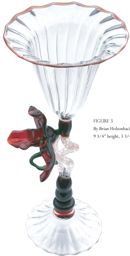
FIGURE 3 By Brian Holsonback 9 3/4" height, 3 3/4" width

My favorite part of working with the Garnet is the clarity of the unique burgundy color and the complete lack of copper surface reduction or "livering." Also, the automatic striking as it cools takes the guess-work out of applying the color and striking it. These features make Garnet a particularly straightforward and user-friendly color to use."