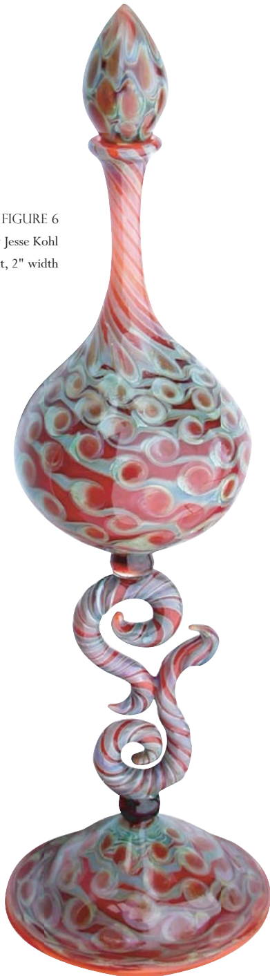
FIGURE 6 By Jesse Kohl 9 1/2" height, 2" width

With the pleasing results of using the Goldenrod as a backing, I was curious to try NS-85 Poppy as a background color. The results can be viewed in figure 6. This vessel was made by encasing NS-85 Poppy in a solid layer of NS-86 Garnet. It was then striped with NS-69 Green Amber Purple and then patterned with NS-09 Yellow. Over each dot of NS-09 Yellow a small dot of the Garnet was added. Notice how the neck thins as it gains a fiery orange hue from the NS-85 Poppy. It is a very vibrant, eye catching color pattern. It would be excellent for beadwork.