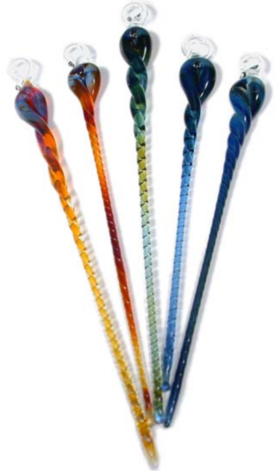
Figure 3 (ornaments by Jesse Kohl)

Figure (3) above, the twist ornaments each represent a member of the Amber/Purple family. From left to right NS-13 Amber/Purple, NS-26 Double Amber/Purple, NS-48 Light Blue Amber/Purple, NS-49 Dark Blue Amber/Purple, and NS-69 Green Amber/Purple. They show the broad range of effects that can be produced by each color. From the top of the ornaments to the tip, the transition produced shows the wide range of colors that are possible to achieve with the Amber/Purple family. Note the haze on the top and the effect it produces can easily be removed to reveal the pleasing color underneath.