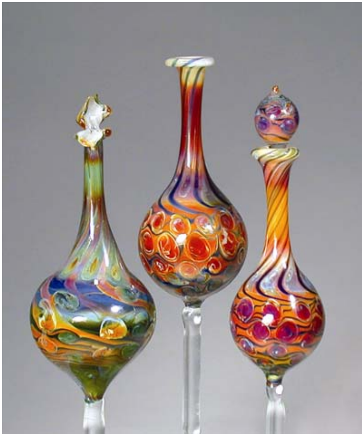
Figure 2 (bottles by Jesse Kohl)

In figure (2) below, the three bottles are examples of what types of effects that one can achieve by enhancing the beauty of the Amber/Purple family with the technique of multi layering. The leftmost bottle in the photo was made by coiling NS-69 Green Amber/Purple over NS-54 Star White, and was striped with NS-26 Double Amber/Purple. Selectively striking the vessel produced the range of color. The central vessel in the photo was created by sandwiching a layer of NS-09 yellow between a base layer of NS-54 Star White and an outer layer of NS-26 Double Amber/Purple. The vessel was striped with NS-49 Dark Blue Amber/Purple and then dotted with NS-26 Double Amber/Purple. Note how fiery the amber yellow color is. The NS-09 Yellow brings out the deep amber reds in NS-13 Amber/Purple and NS-26 Double Amber/Purple, and gives the piece a brilliant glow. The vessel rightmost in the photo was produced by sandwiching a layer of NS-05 Orange between an underlay of NS-54 Star White and an outer layer of NS-13 Amber/Purple. The vessel was striped with NS-20 Dark Cobalt and was dotted with NS-26 Double Amber/Purple. Because the piece was selectively struck, not kiln struck, the NS-05 Orange did not fully strike. The un-struck NS-05 Orange in combination with NS-13 Amber/Purple produced the vibrant honey colored glow.